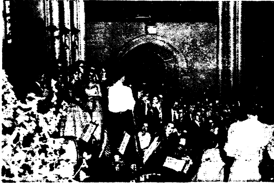
Students pack Great Hall on the occasion of the College's first Inaugural Ball in history.